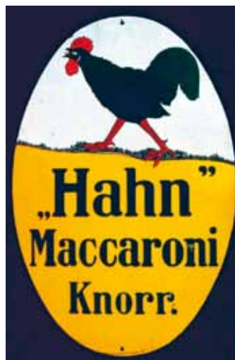
Enamel plaque, 1905 Eisenwerke Gaggenau AG

Advertising is just as old as trade. The late 19 th century brought a new medium to the public, however, which became so prevalent that it was soon called the »sheet metal plague«. Colorful enameled signs that declared house walls and shop entrances animated customers to buy with their memorable motives and distinctive slogans. Many signs are strongly aligned with contemporary art streams, from Art Nouveau to New Objectivity, and quite a few were designed by important artists. The subject range was broad and went from automotive advertisements, to foods, to exotic colonial goods. Some advertising messages and brands are still well known today. The enameled sheet metal ensured a long service life and was superior to the paper poster in this respect. Nevertheless, the sudden decline of the enamel signs in the second half of the 20 th century was impossible to prevent. The exhibition is supplemented by original advertising items, packaging and machines – early messengers of modern marketing strategies.