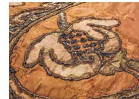
Fragment of a gown, embroidery and appliqué in silk and silver on silk and linen (detail), first half of the 18th century

Embroidery has always met the need of inscribing individuality and meaning into clothing. As a contrast to Fast Fashion and mass production, this centuries-old technology of individual and detailed decoration deserves a comeback. In form, material and motives the current fashion emphasizes craftsmanship and historical references, and uses embroidery as a statement. In light of this, the exhibition shows the recurring relevance of embroidery in fashion across the centuries, using selected examples of its own collection. It offers a tour through the history of fashion from fascinating works from the Coptic time and Middle Ages, to rich embroidery of Baroque, works from the 19 th century and up to new acquisitions of the GRASSIMESSE in the 20 th and 21 st century. The show also presents selected contemporary examples of Haute Couture and innovative works of textile artists and young talents. Traditional, as well as digital techniques and new materials, offer unexpected options for this special technique of textile improvement. They are shown here in a fascinating and innovative manner.