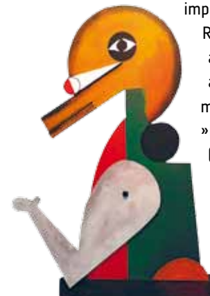
Erich Mende, Figure of a stage set for a theatre performance in Leipzig, around 1930 Reconstruction: Thomas Moecker, 2018