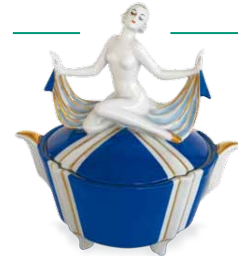
Tin with lid, Heubach Kaempfe & Sontag Wallendorf/Thuringia after 1930

Extravagant shapes, playful motives and diverse colors characterize the high-quality products of the porcelain manufactures in the years between the wars. The mocha sets and tins presented in the exhibition represent small luxury objects that cannot be classified as strict display objects, but aren't items of daily use either. They often come with some elements of the jagged style that characterizes the architecture of the pillar hall in which the exhibition is shown as well. Elaborate two- or three-dimensional figurative presentations were just as popular – for example depicting exotic animals. Doubtlessly unusual in scope and diversity, the Hamburg collections of Gisela Krause-Ausborn and Gerd Ausborn, as well as that of Professor Peter Schatt, entice with their different focuses and decades of passion for collecting. A selection of objects from these collections is presented together for the first time in this combination, creating a cross-section through the design variations of Art Déco.