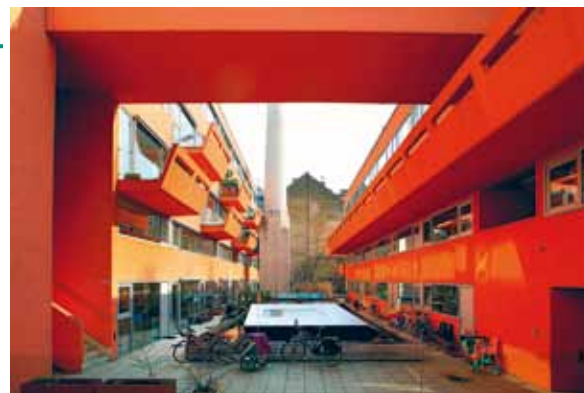
Courtyard of the Sargfabrik, Vienna, BKK-2, 1992–96

As it has become increasingly clear in the last few years, residential space is a scarce resource. The real estate prices in the metropolises are rising, and classical concepts of residential construction no longer meet the demands. These challenges have triggered a silent revolution in contemporary architecture: building and living in a collective. TOGETHER! The New Architecture of the Collective is the first exhibition that illuminates this subject comprehensively and makes it possible to spatially experience it. Based on models, films and living situations on a 1:1 scale, it presents not only a large number of examples from Europe, Asia and the USA, but also ten building projects from the growing city of Leipzig. Historical precursors at the same time illustrate the history of the communal architecture, from the reform ideas of the 19 th century to the hippie and squatter scene under the slogan of »Make love, not lofts«.