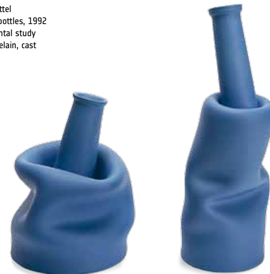
Hubert Kittel Drunken bottles, 1992 Experimental study hard porcelain, cast

02.04.2019 — 13.10.2019 BALANCE // TECTONICS